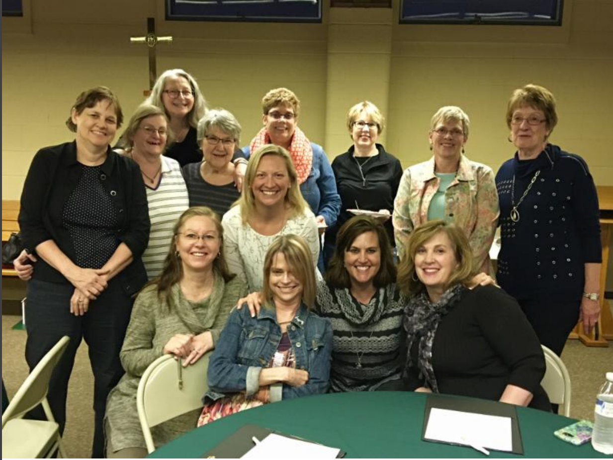
A great evening was had by this group at Monday Maven's Wine Tasting Event April 2017