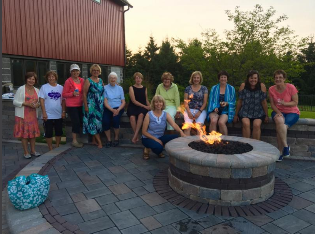
A great evening for a Monday's Maven's Barn Gathering! July 2017